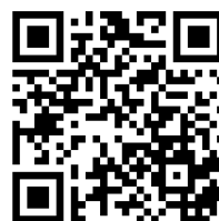
Swindon Chess Club Facebook